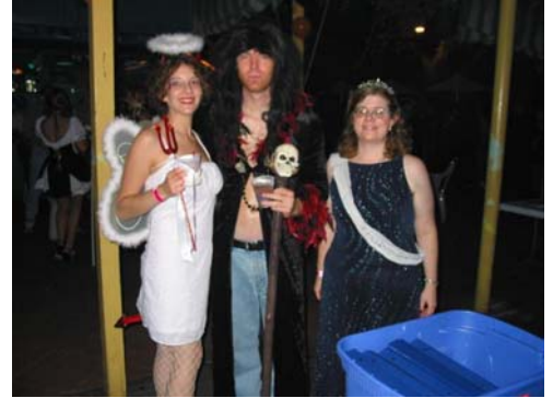
2004 Halloween Social