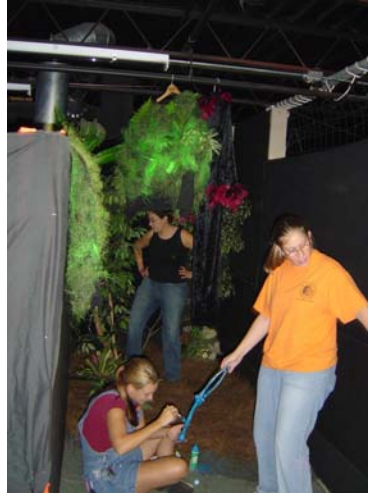
2004 Haunted House Construction