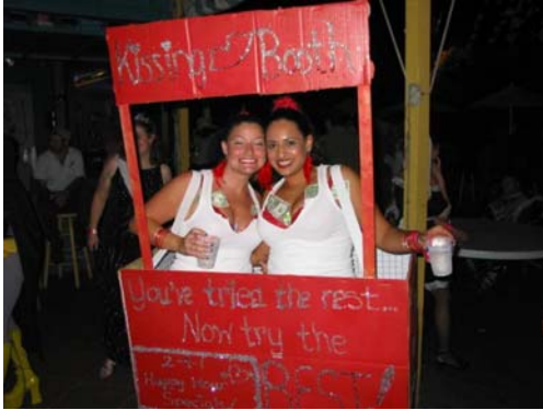
2004 Halloween Social