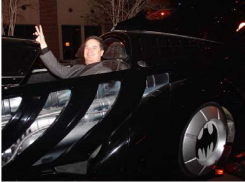
2005 Bids for the Kids