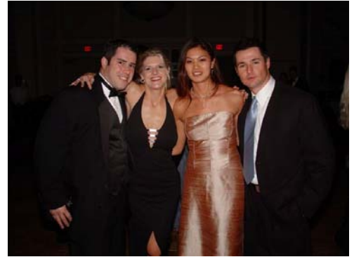
2005 Bids for the Kids