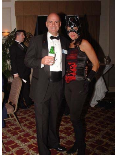
2005 Bids for the Kids